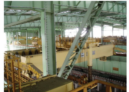
Installation of crane transmissions