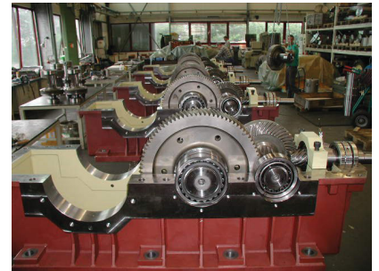
Installation of hoist gears